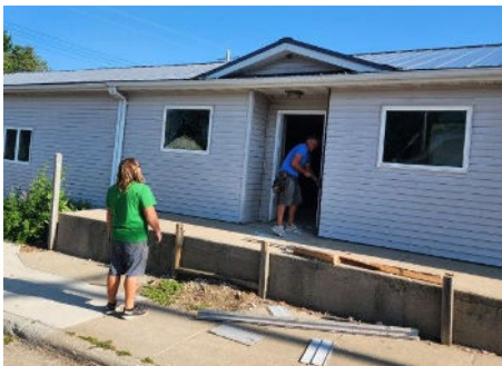
Renovation improvements on the current 3rd street entrance.