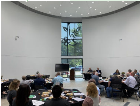
At Cansayapi Wicoicage Oti, the Lower Sioux Indian Community Cultural Incubator

The Southwest Regional Development Commission celebrated its 50th Anniversary at the Annual Meeting at the Lower Sioux Indian Community on July 13, 2023.