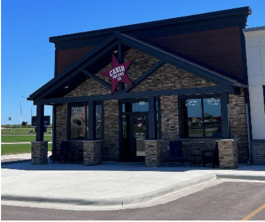
Cabin Coffee in Jackson

Currently, the SRDC has three separate loan funds available to help with your business, including two revolving loan funds and our Property Assessed Clean Energy or PACE program.